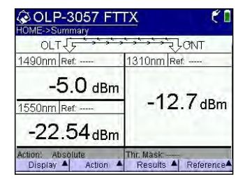
OLP-3057 Measurement screen