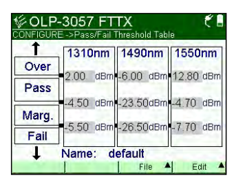
OLP-3057 Pass/Fail screen